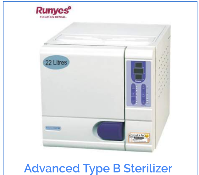
Advanced Type B Sterilizer