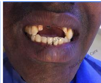
Upper Front Missing teeth restored with Implants