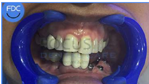
Implants on lower left side