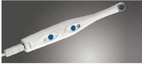
Sirona Intra-oral Camera