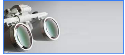
Heine Binocular Loupes