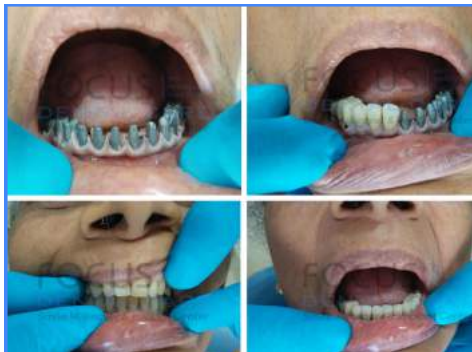
Fixed Implant supported Malo bridge